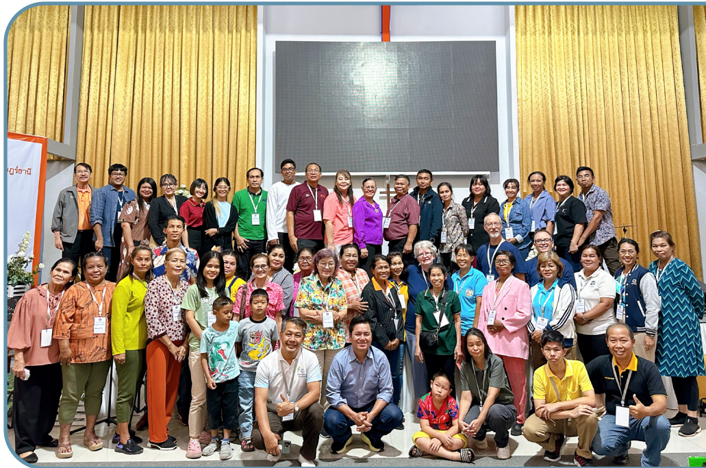
LEFT: Members of the Surat Thani Engagement Team at a secondary training event in August 2024.